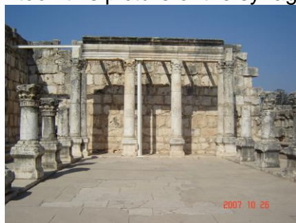
This is the actual place where Jesus walked.

I took this picture of the synagogue the centurion had built when I was there in 2007.