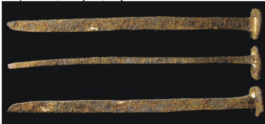
Roman Crucifixion Spikes from the 1st or 2nd Century