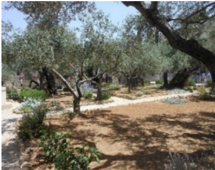
This is a picture of the Garden of Gethsemane, of where Jesus and his disciples are walking to, and Jesus will be arrested.

As I mentioned there is a transition going on here. They are leaving the Upper Room, and Jesus begins teaching them to prepare them for their task ahead. What is that task? Go and make disciples of all nations! As they are walking, Jesus is reminding them where they will get their faith, where they will get their strength, where they will get their words, are to abide, remain in him, they will produce fruit for the Kingdom of God.