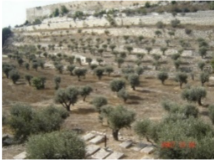
This is a picture of the Kidron Valley looking back towards Jerusalem from the Mount of Olives.