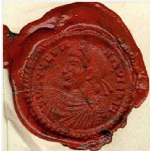
EXEMPLAR ROMAN SEAL (MORE)