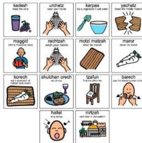
Order of the Seder