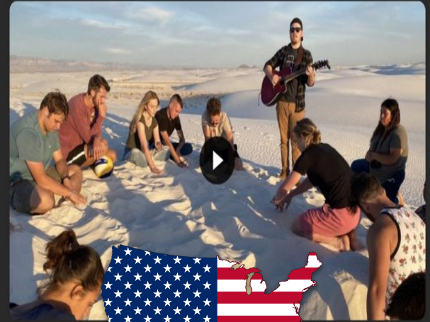
Tenth Hour Project