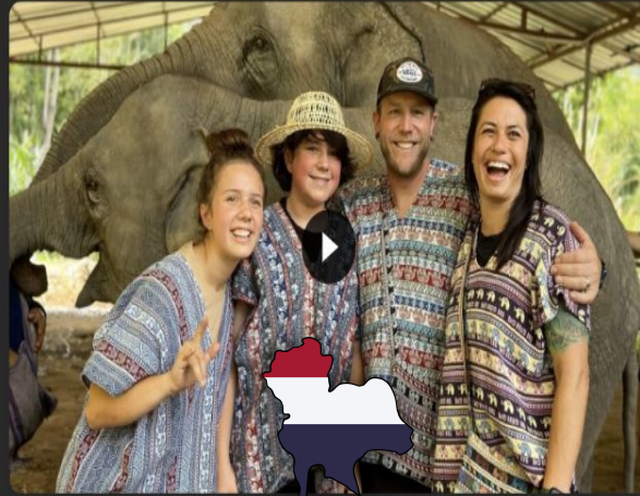
Within Reach Global