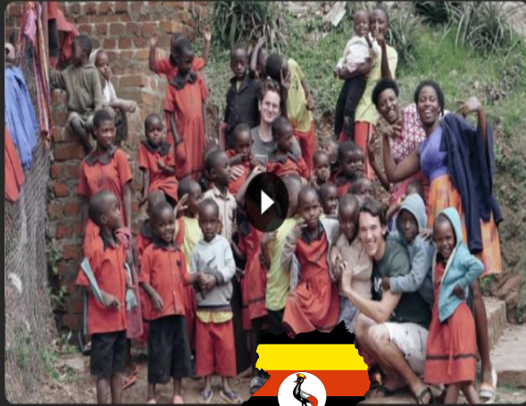
Uganda Kids Project