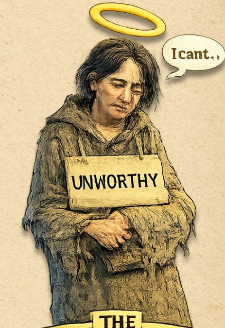
THE SELF DISQUALIFEER