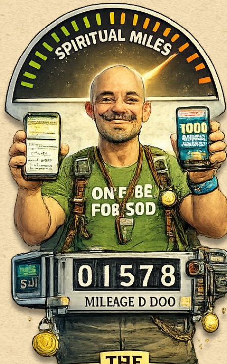
THE MILEAGE COUNTER