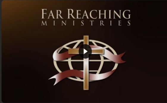
Far Reaching Ministries