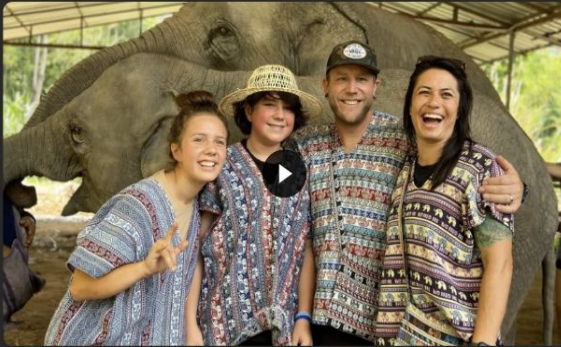
Within Reach Global