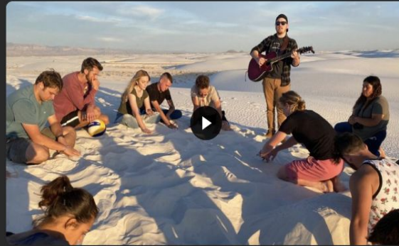
Tenth Hour Project