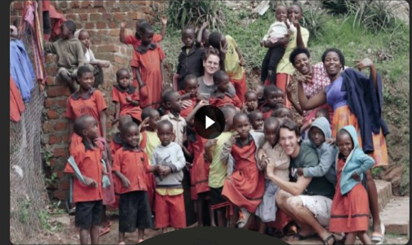
Uganda Kids Project