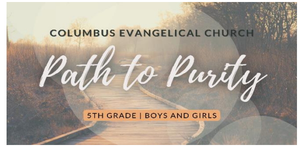
March 24th-25th Sign up in the gym or by calling the office