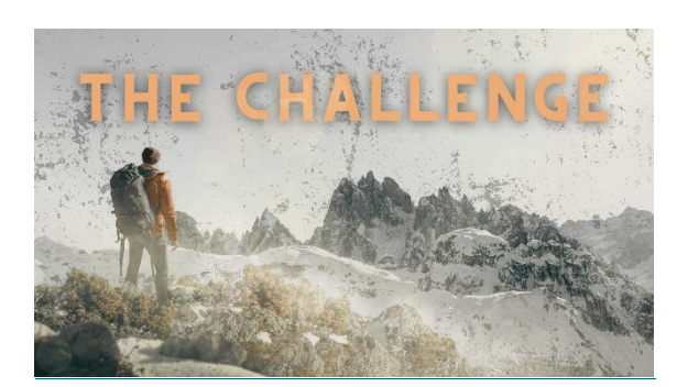
Middle School & High School Youth Event March 24<sup>th</sup> at 5:00pm Taco Bar Dinner/Worship/Speaker/Games