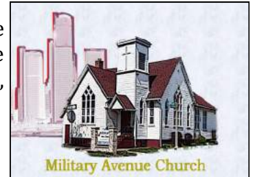
Military Avenue Church

Meet in the Cornerstone parking lot at 7:30 am to car-pool to Military Avenue. Join the “Turkey Brigade” or help with food boxes. Have some fun with the children; games and crafts and then Christmas presents are passed out! Many hands are needed to make this event a success.