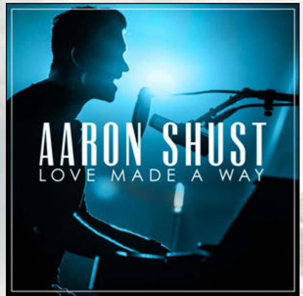
"LOVE MADE A WAY" by Aaron Shust