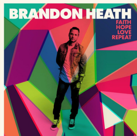
Faith Hope Love Repeat by Brandon Heath