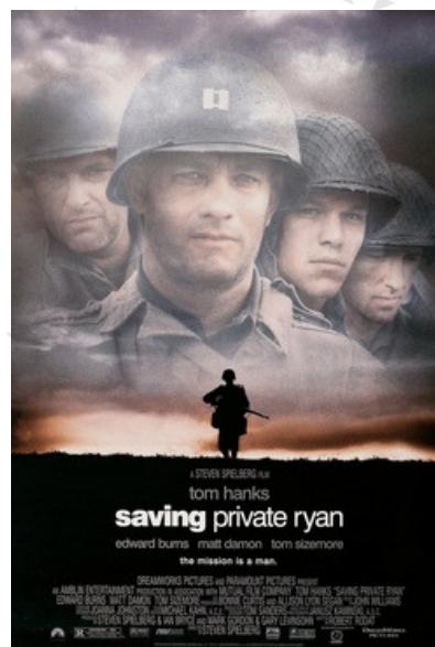
Saving Private Ryan