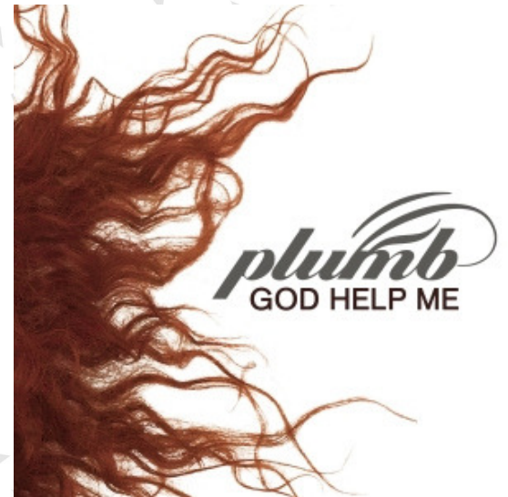
God Help Me by Plumb