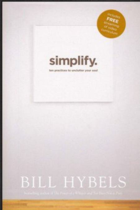
"SIMPLIFY: 10 Practices To Unclutter Your Soul" by Bill Hybels