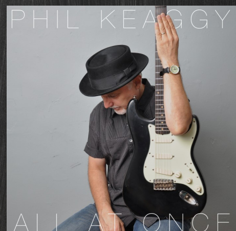
"All At Once" by Phil Keaggy