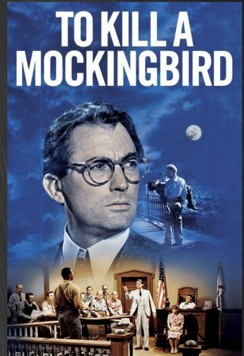
To Kill A Mockingbird