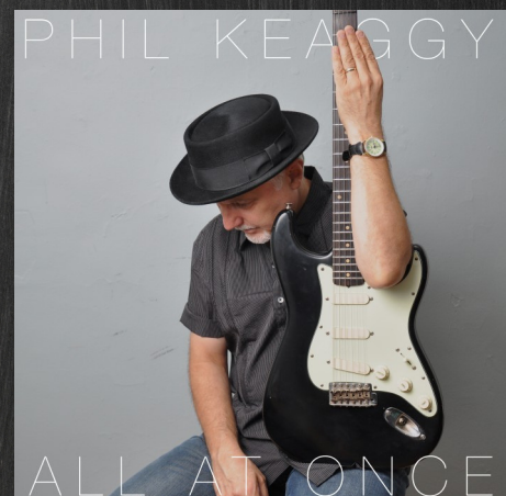
"All At Once" by Phil Keaggy