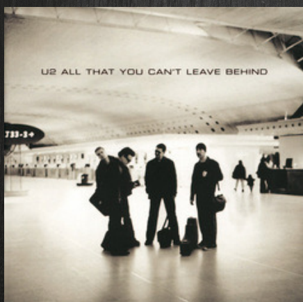
"All That You Can't Leave Behind" by U2