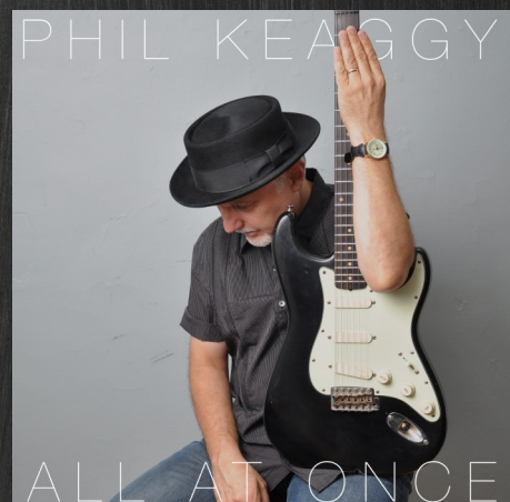
"All At Once" by Phil Keaggy