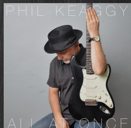
"All At Once" by Phil Keaggy