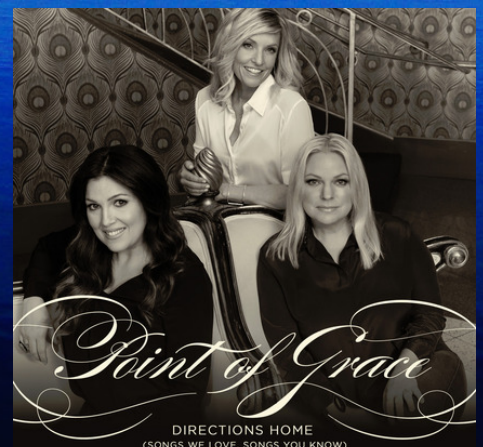
"Directions Home" by Point of Grace