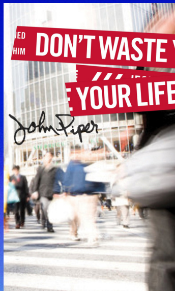
"Don't Waste Your Life" by John Piper