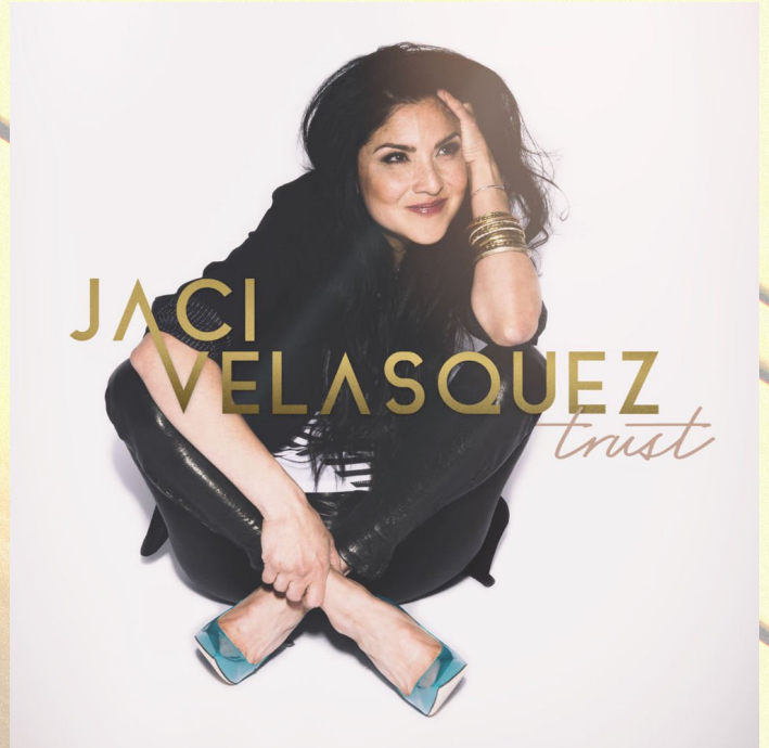
"TRUST" by Jaci Velasquez