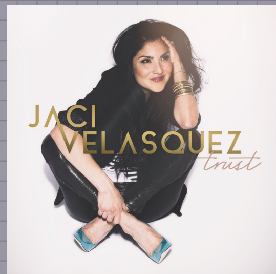
"TRUST" by Jaci Velasquez