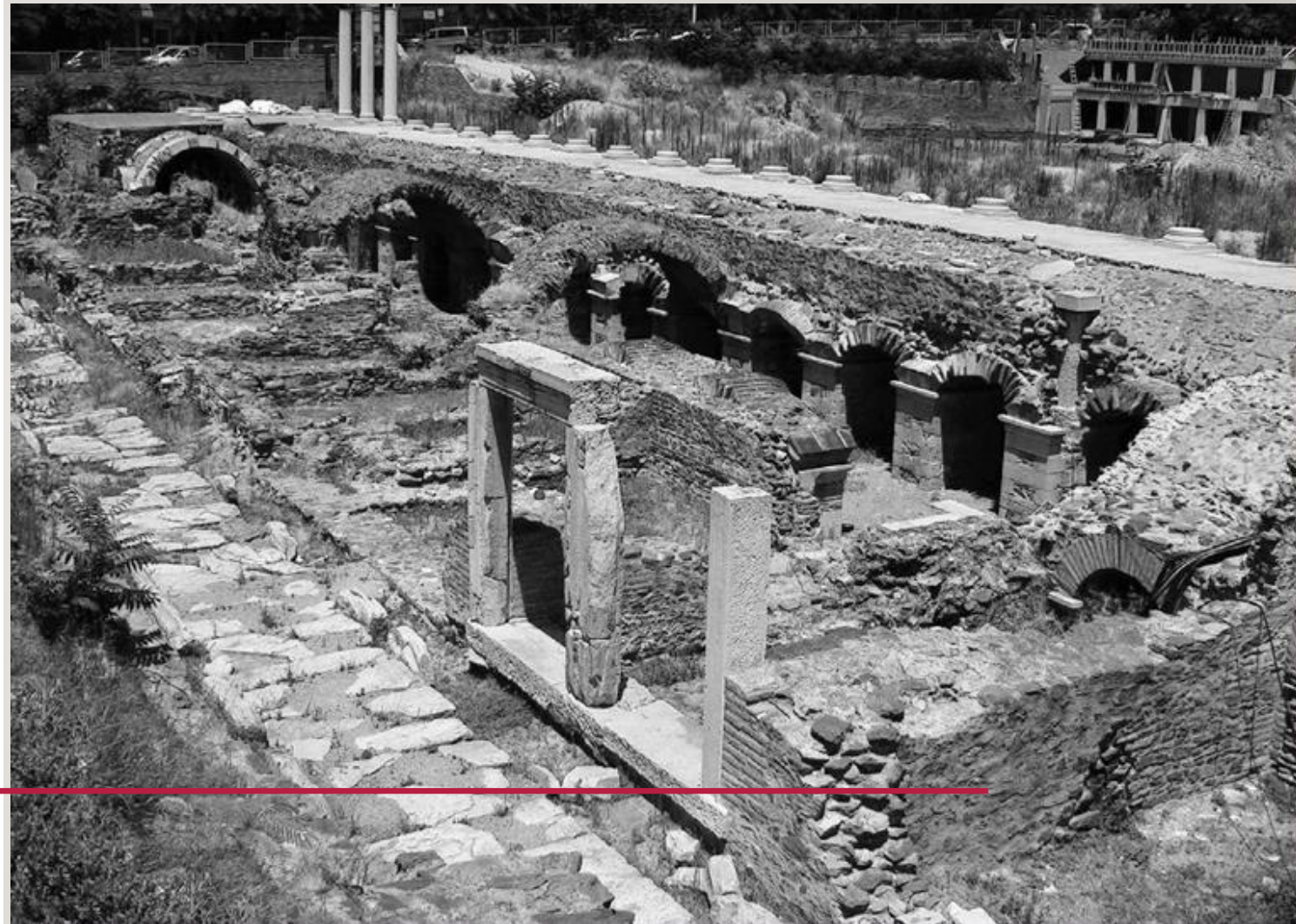
The ruins of the agora , a Roman shopping center, in Thessalonica, built around the first century.