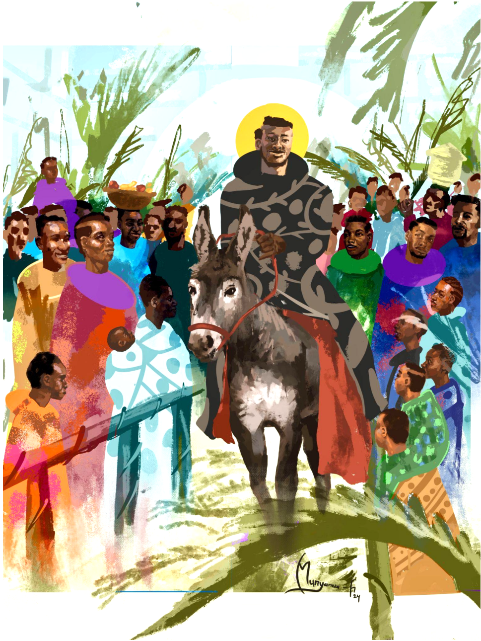
TRINITY Palm Sunday 2024