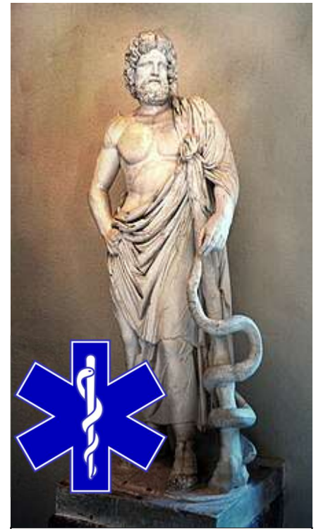
Asclepius, Greek god of healing and medicine. Many healthcare symbols today feature the rod of Asclepius.