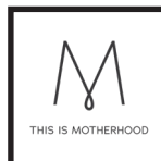
THIS IS MOTHERHOOD