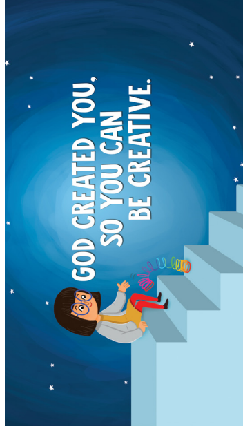
Bottom Line - Week 2