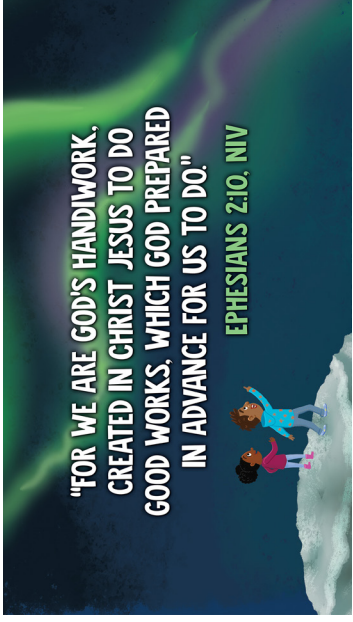
Ephesians 2:10 NIV