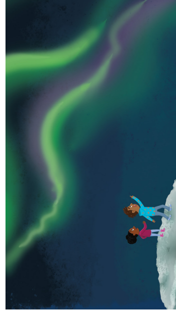
Memory Verse - Blank