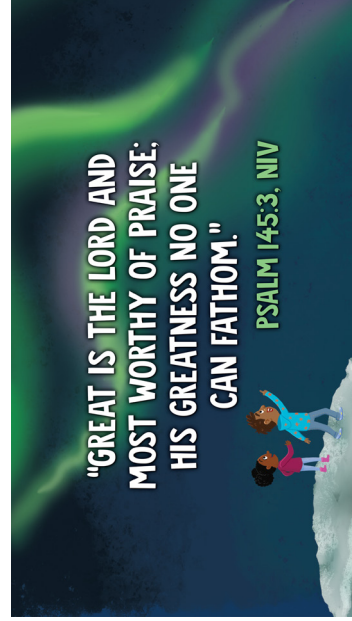
Memory Verse - NIV