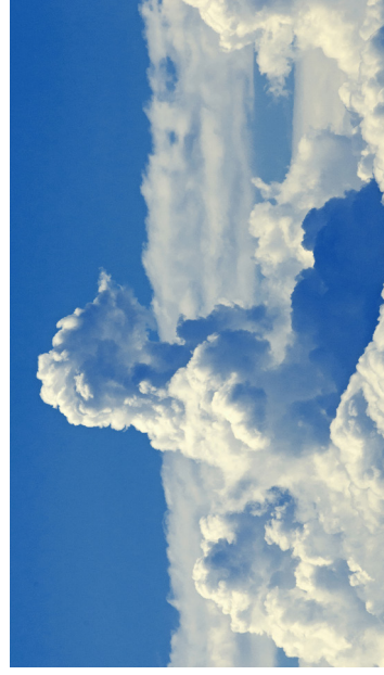
Opener Photo 2c