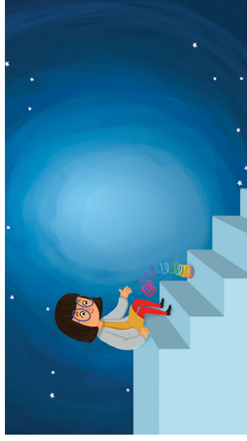
Bottom Line - Blank