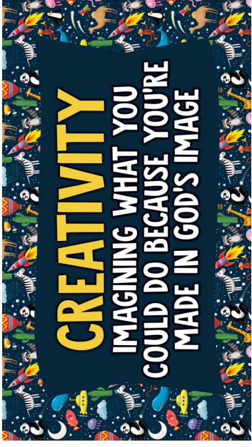
Life App - Creativity