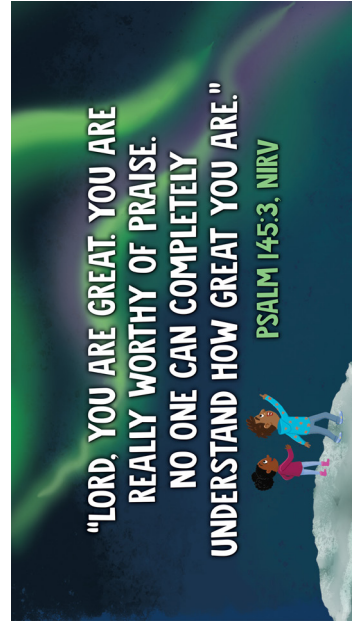
Memory Verse - NIRV