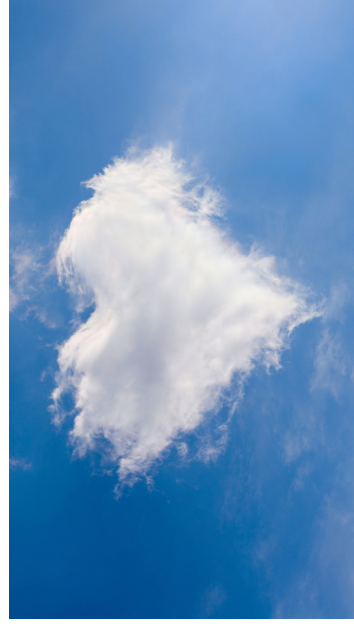
Opener Photo 2b