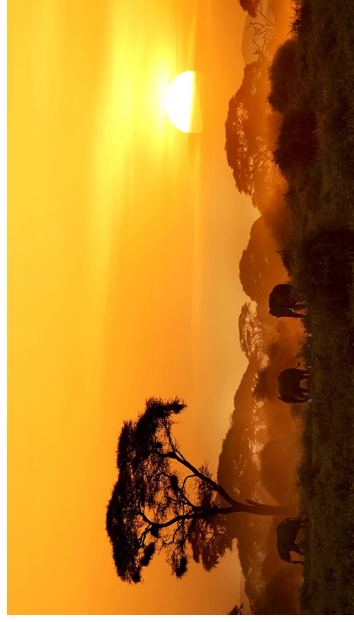
Opener Photo 1c