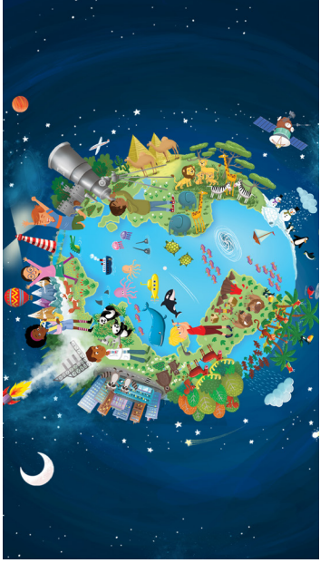
Theme - Blank