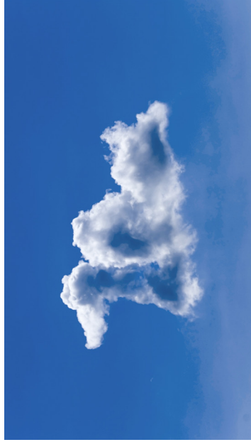
Opener Photo 2a