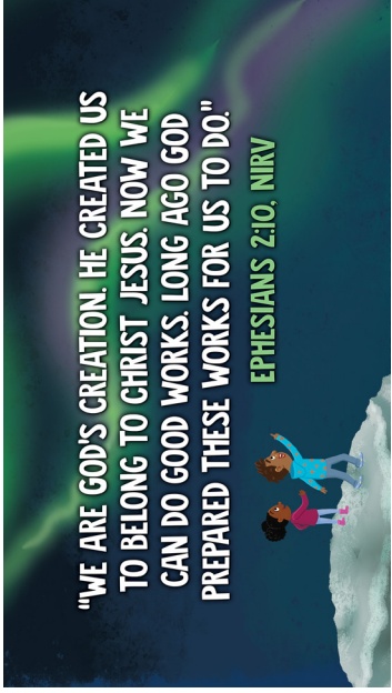
Ephesians 2:10 NIRV