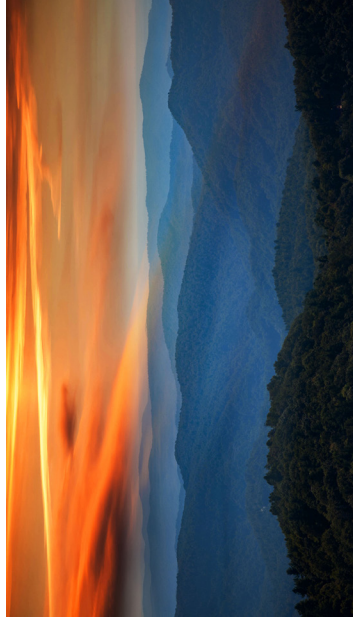
Opener Photo 1a