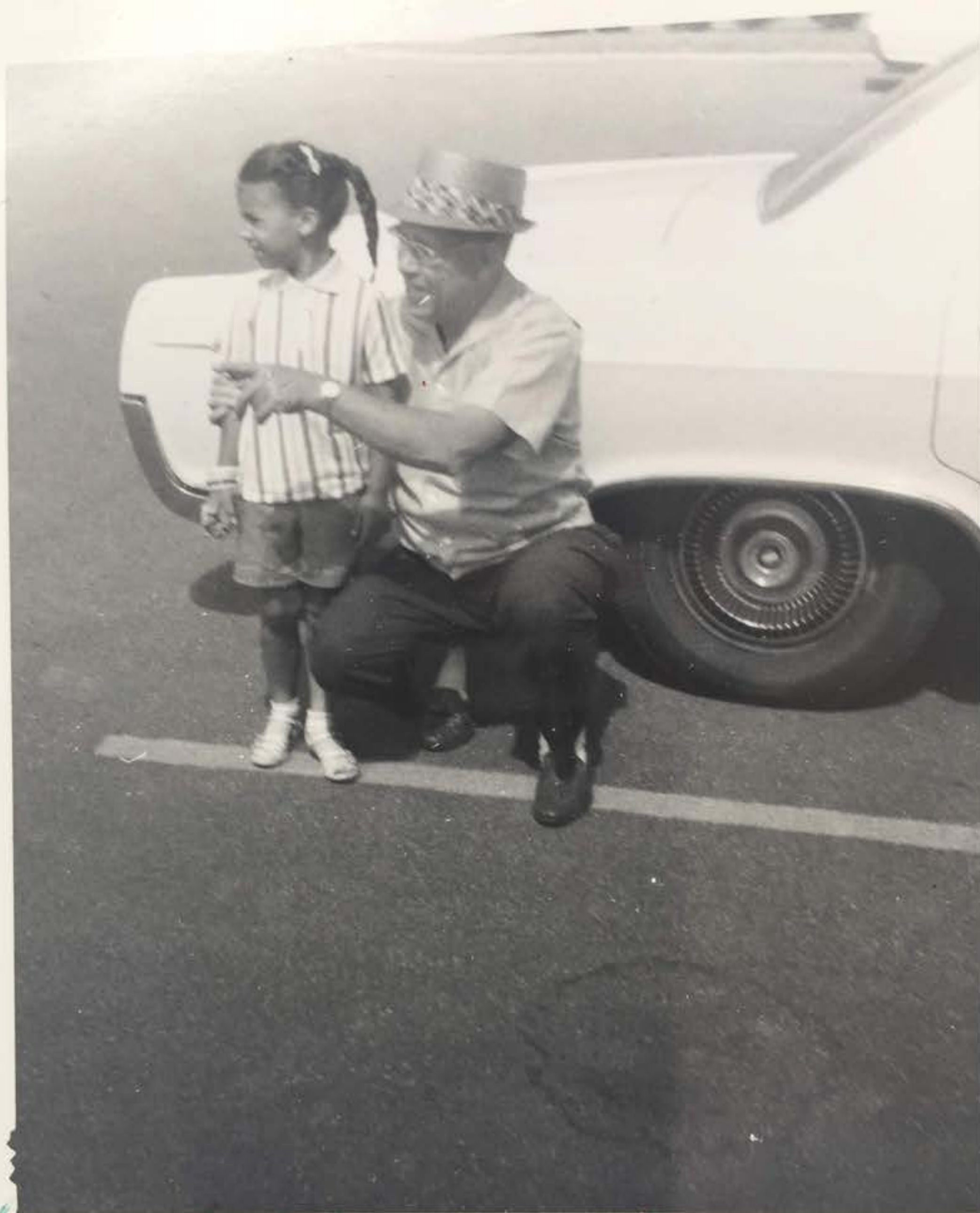
Howard Johnson's, 6/5, 65