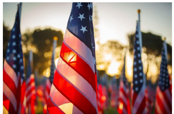
FLAG DAY - JUNE 14TH