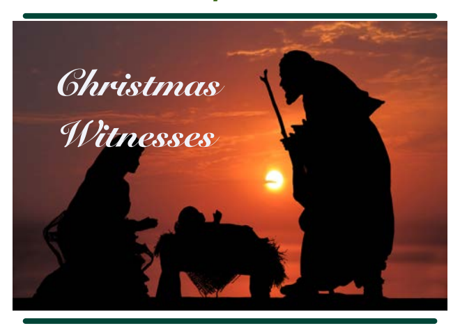
Don't Be Afraid!

Luke 1:26-38, 2:1-6, 16-19, Matthew 1:18-25