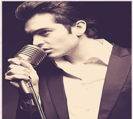
ALTO TAKE CHURCH BY STORM