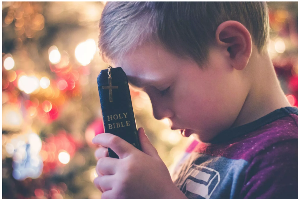
25 Bible verses for kids

Learning Bible verses can feel daunting. How do you start and what verses should you choose? A list of 25 Bible verses for kids to memorize and suggestions on how to make it fun can get you and your family started.