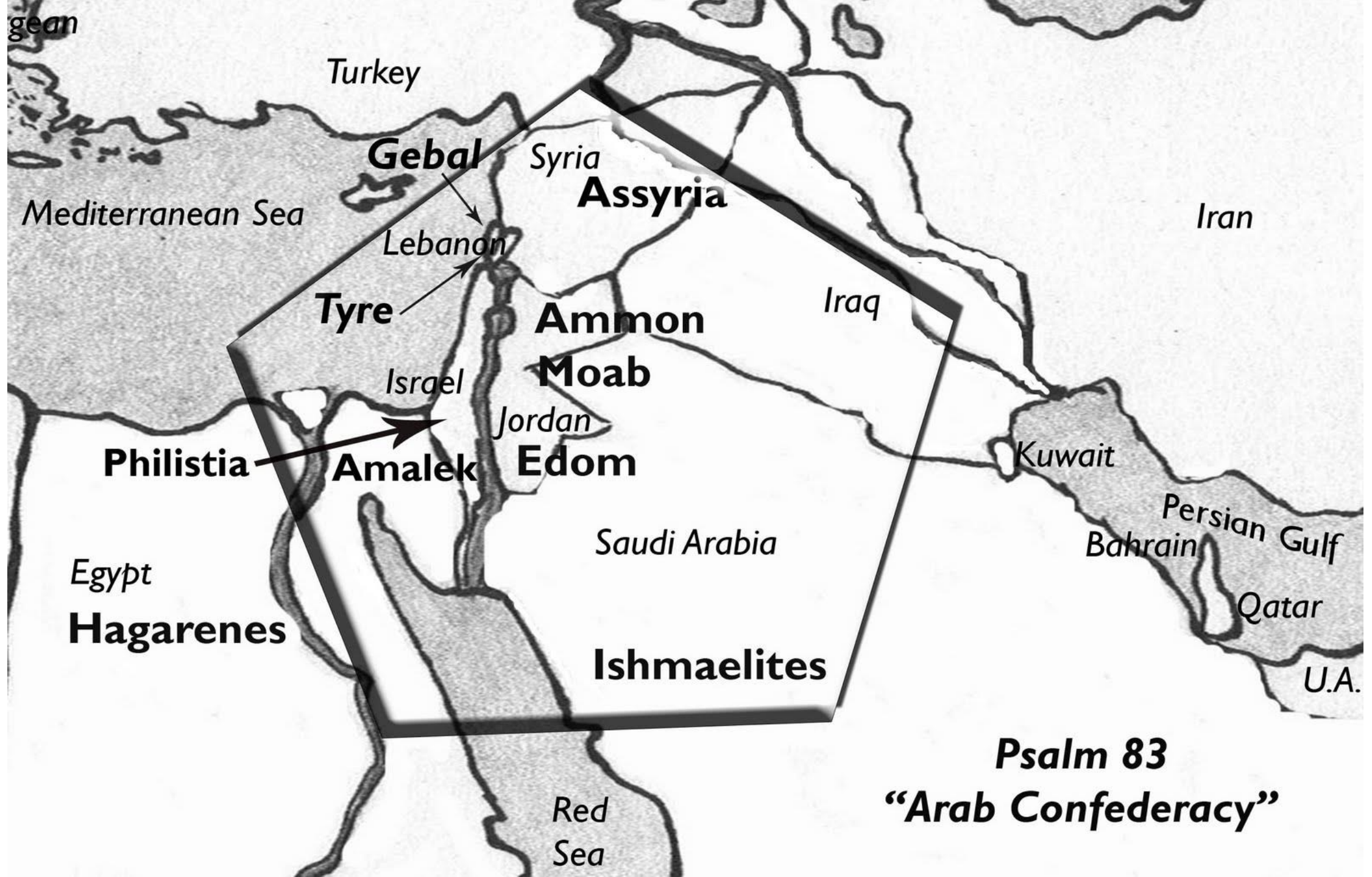
Psalm 83 “Arab Confederacy”