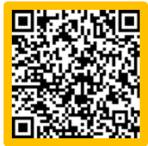
QR BY POSITION