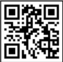
Scan for Events

We are a group of middle schoolers and high schoolers who are head-over-heels excited about how Jesus has ignited unending joy in our hearts. Our Youth Ministry exists to fan into flame what the Lord is doing among the 6th - 12th grade students in this region. We meet weekly on Sunday evenings from 6-7:30pm.