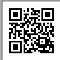
Scan to Give!

3601 W Belleview Ave., Littleton, CO 80123 303-794-6851 www.sjpres.org