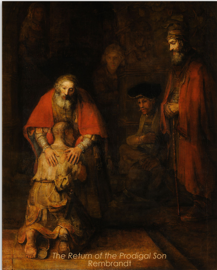
The Return of the Prodigal Son Rembrandt

28 “The older brother became angry and refused to go in. So his father went out and pleaded with him. 29 But he answered his father, ‘Look! All these years I’ve been slaving for you and never disobeyed your orders. Yet you never gave me even a young goat so I could celebrate with my friends. 30 But when this son of yours who has squandered your property with prostitutes comes home, you kill the fattened calf for him!’ 31 “‘My son,’ the father said, ‘you are always with me, and everything I have is yours. 32 But we had to celebrate and be glad, because this brother of yours was dead and is alive again; he was lost and is found.’”