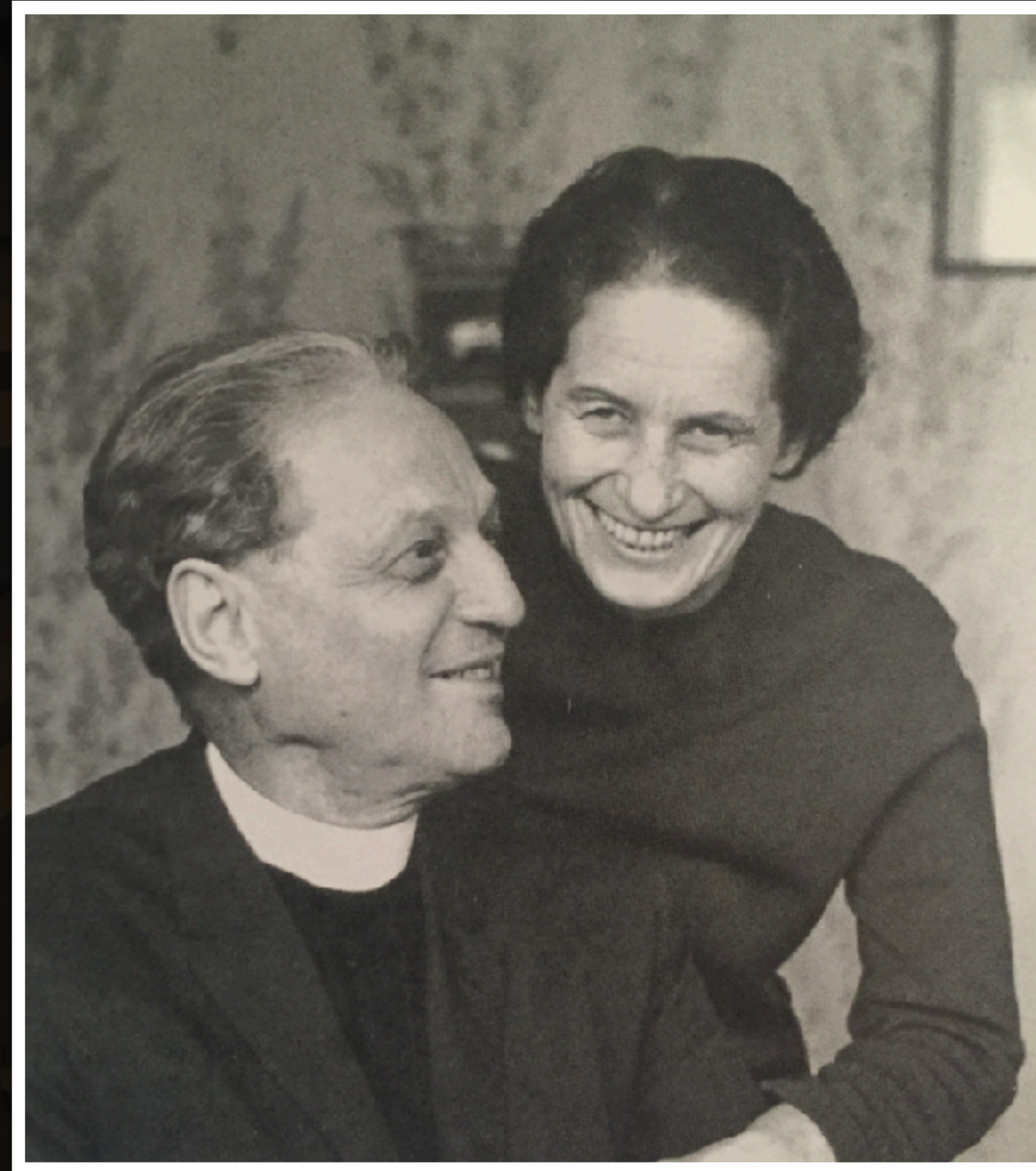
Richard and Sabina Wurmbrand