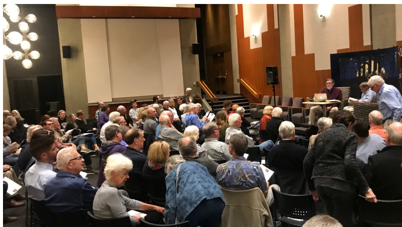
Kindlings Muse at Walker Ames room in Kane Hall at University of Washington