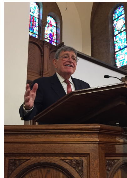
In the pulpit at First Presbyterian Tacoma in June

I am reminded of two human markers. The first is to recognize goodness and humorous joy. It was the goodness and humor that prepared that young soldier C.S. Lewis for meeting Jesus. He found the center that the goodness revealed. He was "surprised by joy." The second is to keep focus and not veer from the centrality of Christ and what He taught us during His life on Earth. Lewis met this Jesus. The world has benefited from what Lewis has given in testimony through his writing of who Jesus is and what it means to live a life that reflects the power of good to overcome evil and to remember always that how we live should point to the Jesus.