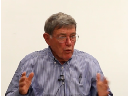
Listen to Part I on our website.