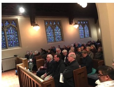
Henry Chapel in The Highlands