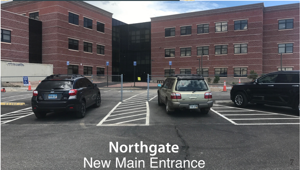
Northgate New Main Entrance