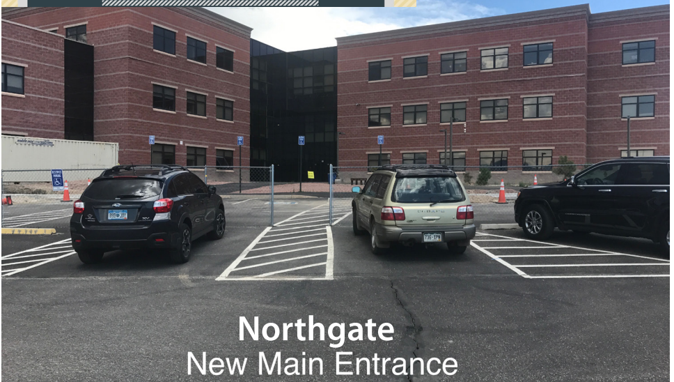
Northgate New Main Entrance