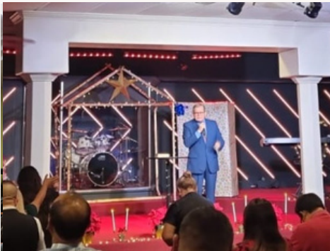
CASA DEL ALFARERO, BVLLE, TX

We had a great time visiting part of our family, friends and different churches last January, where we witnessed how God moved in each of these Churches. We could feel the love and grace of God moving in each assembly. We saw lives changed before our eyes! The Holy Spirit is moving in Matamoros and South of Texas! Come on Jesus!