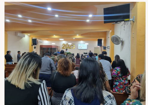
LA CRUZ DEL CALVARIO