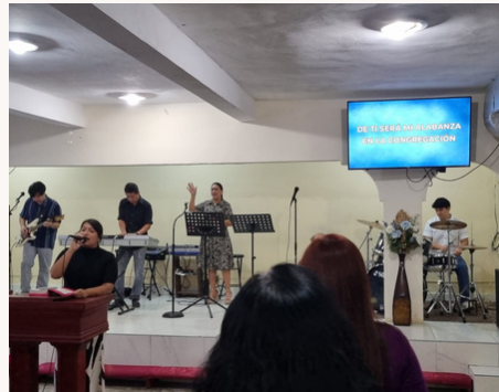
CENTRO CRISTIANO EMMANUEL