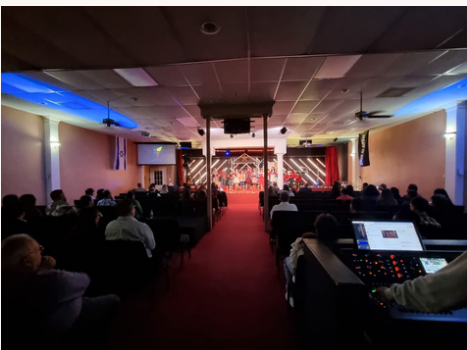
CASA DEL ALFARERO, BVLLE, TX