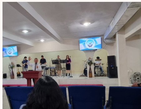
CENTRO CRISTIANO EMMANUEL