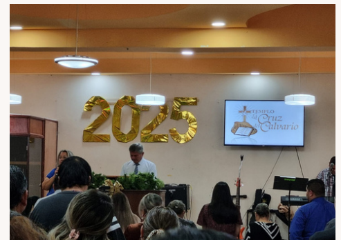
LA CRUZ DEL CALVARIO