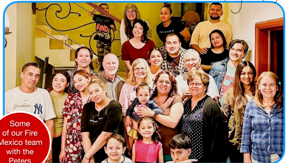
Some of our Fire Mexico team with the Peters