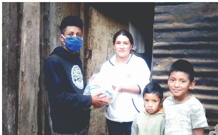
Launch of the Cadaniño youth missions club during the COVID-19 pandemic

Watch "Everyone Has Something to Give", a short video about how our youth missions club was started