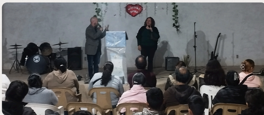
Translating at San Lucas Church

Our friend passed away. We had the honor to accompany the family and see the hope in Him. He is our strength.