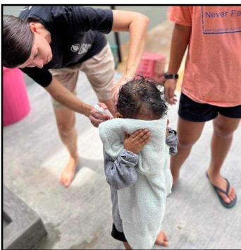
One of our little ones getting treated with lice shampoo