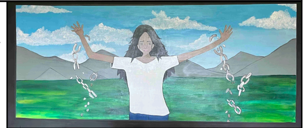
Our two AMAZING paintings!