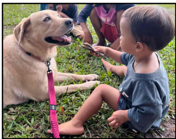
Maya with one of our little guys

Also, our other dog, Maya, has been having some health problems in the last several months! ☺ Out of the blue, a little more than a month after Macy passed away, Maya started having some problems moving around. The vet has been doing some treatments on her and actually let her stay at his clinic in Davao for a while so that we wouldn't have to drive her back and forth. For a while, she was actually having trouble walking and putting weight on her back legs, but she has been improving, and we are hopeful that she will fully recover! Please join us in praying that she will recover quickly!