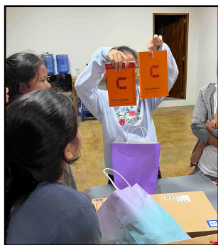
Our newest 17-year-old with a new book and study guide for her birthday

We celebrated another birthday before the month was over. It was the birthday of the youngest of the first three sisters that came to us in 2016. She turned 17 years old!! She was 9 when she came to us. It is SO hard to believe that the youngest of our first three girls is now 17! Good thing the rest of us are not getting older!! (Haha — I wish!) ☺