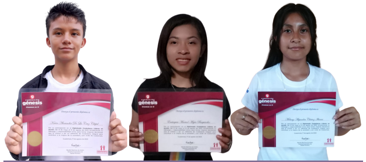
Cadaniño Leaders in Action Graduates

While we teach many of the same values in our Bible studies with students, this collaboration with a local organization has created a comprehensive framework that provides for leadership development, social skills enhancement, and life project planning which aligns seamlessly with our values, amplifying our efforts to empower each child in our program to reach their full potential and equipping our students with the tools, mindset, and support necessary to rise above their circumstances and challenging them to emerge as resilient, compassionate, and visionary leaders.