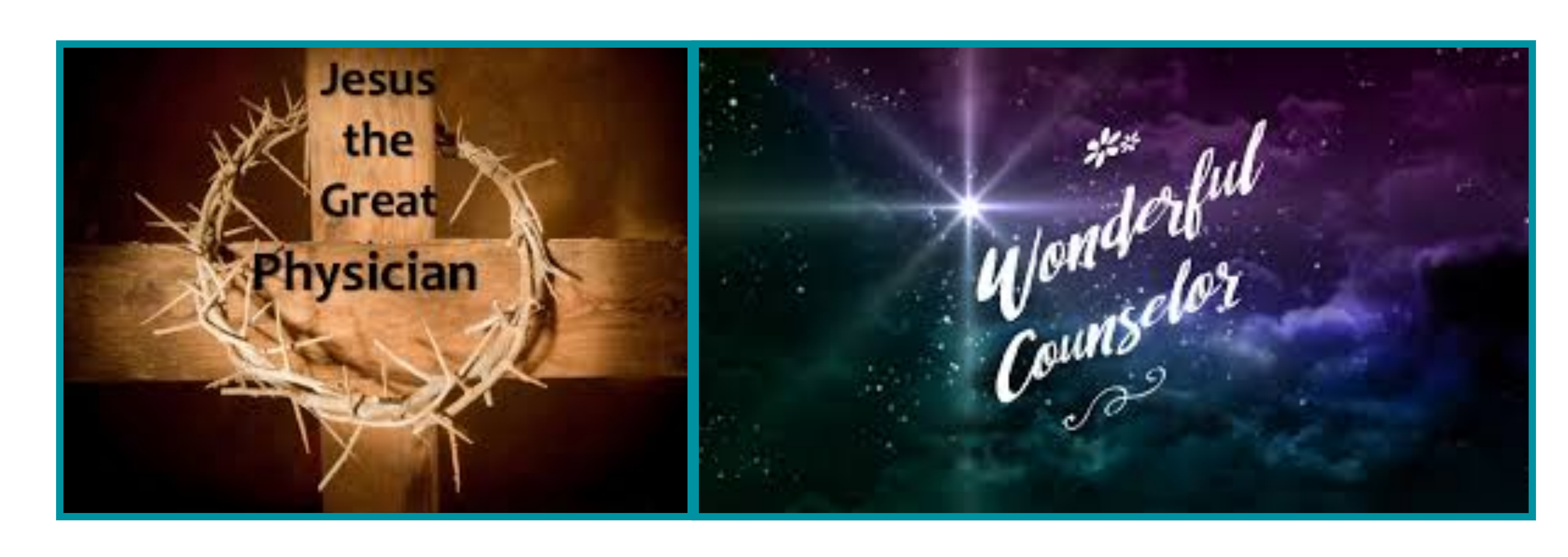
a gateway collection