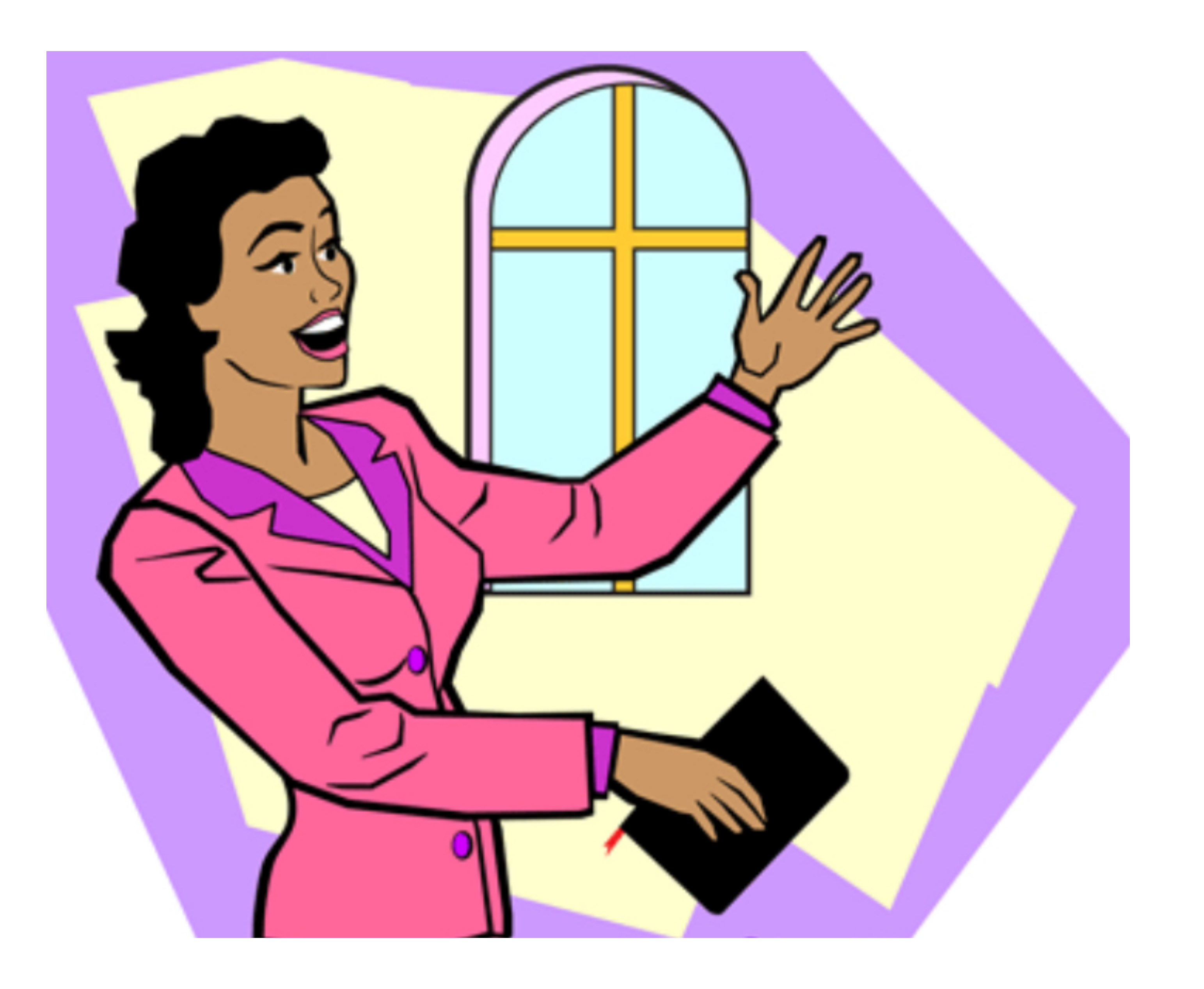
a gateway collection