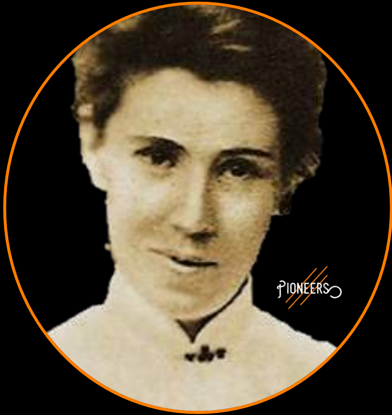
Amy Carmichael ON OBSTACLES

"IT IS GREAT TO BE FACED WITH THE IMPOSSIBLE, FOR NOTHING IS IMPOSSIBLE IF ONE IS MEANT TO DO IT. WISDOM WILL BE GIVEN, AND STRENGTH. WHEN THE LORD LEADS, HE ALWAYS STRENGTHENS."