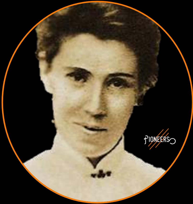
Amy Carmichael ON FAITH

"ALL ALONG, LET US REMEMBER WE ARE NOT ASKED TO UNDERSTAND, BUT TO OBEY."