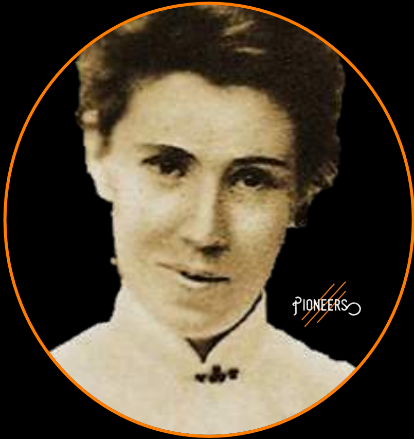
Amy Carmichael ON SLANDER

“LET NOTHING BE SAID ABOUT ANYONE UNLESS IT PASSES THROUGH THE THREE SIEVES: IS IT TRUE? IS IT KIND? IS IT NECESSARY?”