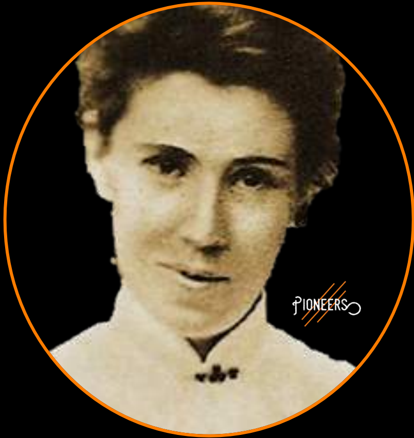
Amy Carmichael ON HOPE

"JOYS ARE ALWAYS ON THEIR WAY TO US, THEY ARE ALWAYS TRAVELING TO US THROUGH THE DARKNESS OF THE NIGHT. THERE IS NEVER A NIGHT WHEN THEY ARE NOT COMING."