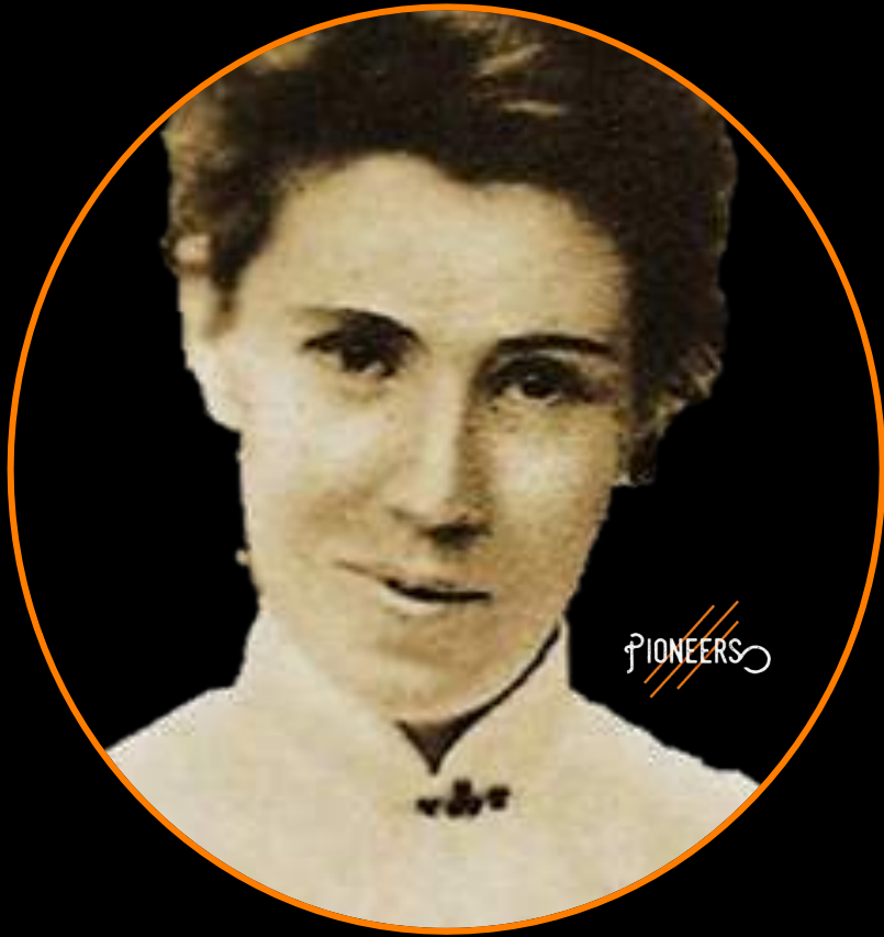
Amy Carmichael ON FORGIVENESS

"IF I SAY, "YES I FORGIVE, BUT CANNOT FORGIVE," AS THOUGH GOD, WHO TWICE A DAY WASHES ALL THE SANDS ON ALL THE SHORES OF THE WORLD, COULD NOT WASH SUCH MEMORIES FROM MY MIND, THEN I KNOW NOTHING OF CALVARY LOVE."