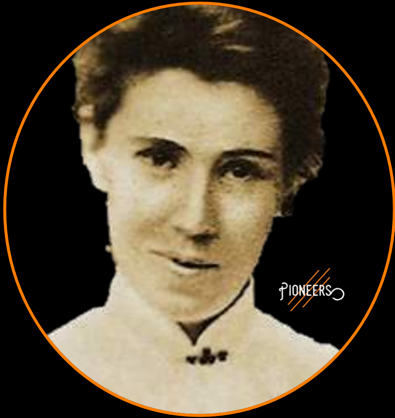
Amy Carmichael ON SUFFERING

“LET US NOT BE SURPRISED WHEN WE HAVE TO FACE DIFFICULTIES.