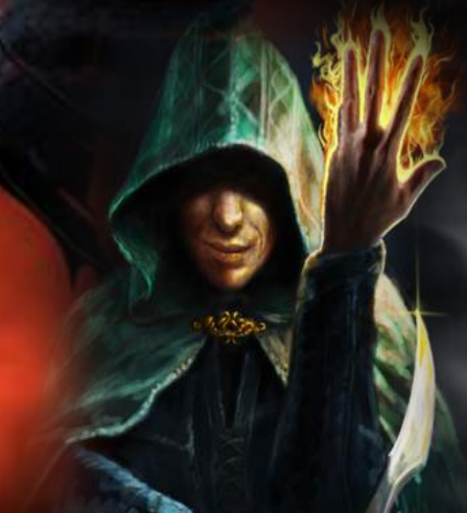
False Prophet (Holy Spirit)