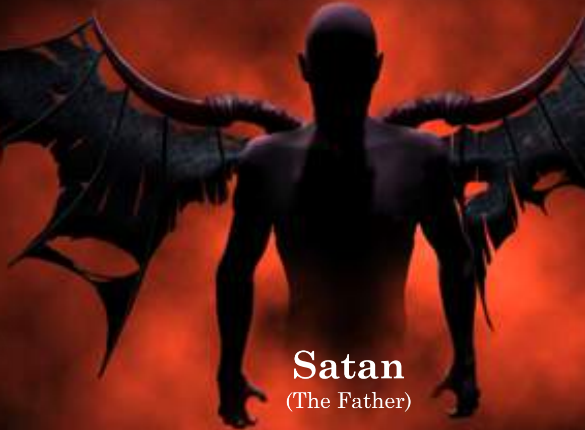
Satan (The Father)