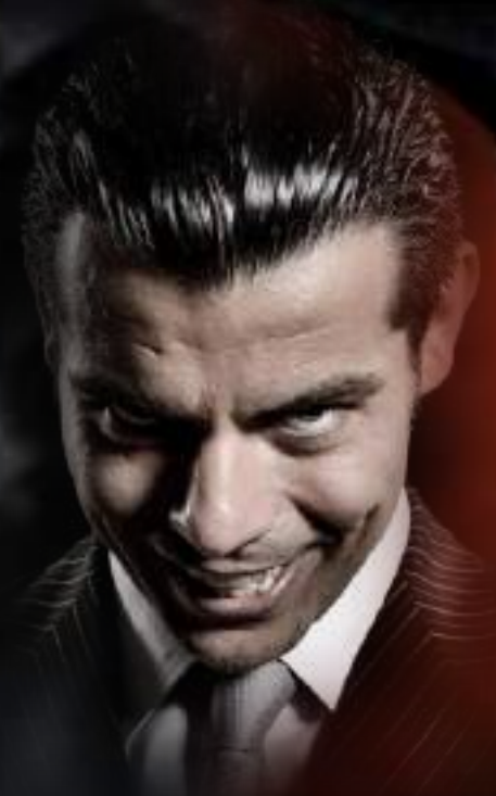
Anti-Christ (The Son)